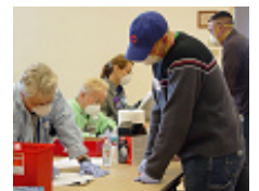
MRC volunteers during the 2005 Regional Bio-Terrorism Exercise

All interested community members are welcome to participate.